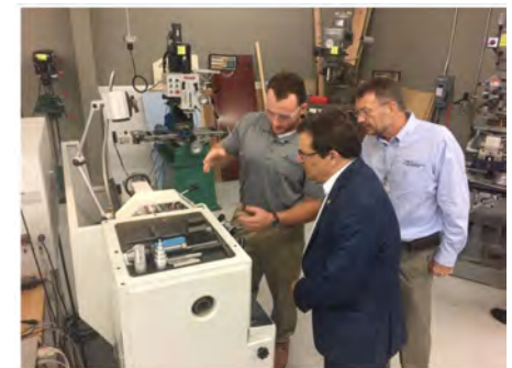
U.S. Rep. Gus Bilirakis, front, taking a tour of the AmSkills facility in New Port Richey.

Included in the bill is Bilirakis' provision, known as the VETERAN Act, which would authorize $30 million to help the VA invest in modernizing their information technology systems for processing claims. The goal of the provision is to help veterans receive benefits in a more timely and efficient manner.