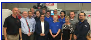
Congressman Gus Bilirakis & AmSkills Adult Pre-Apprentices